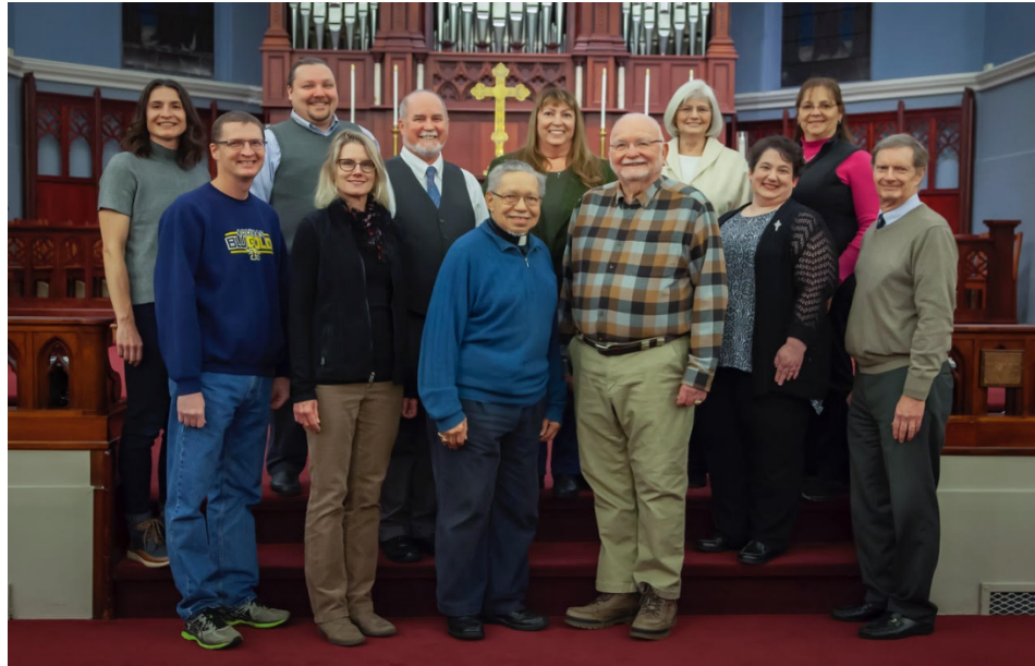
Interim Rector, Wardens and Vestry