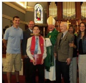
Bishop with the newly confirmed